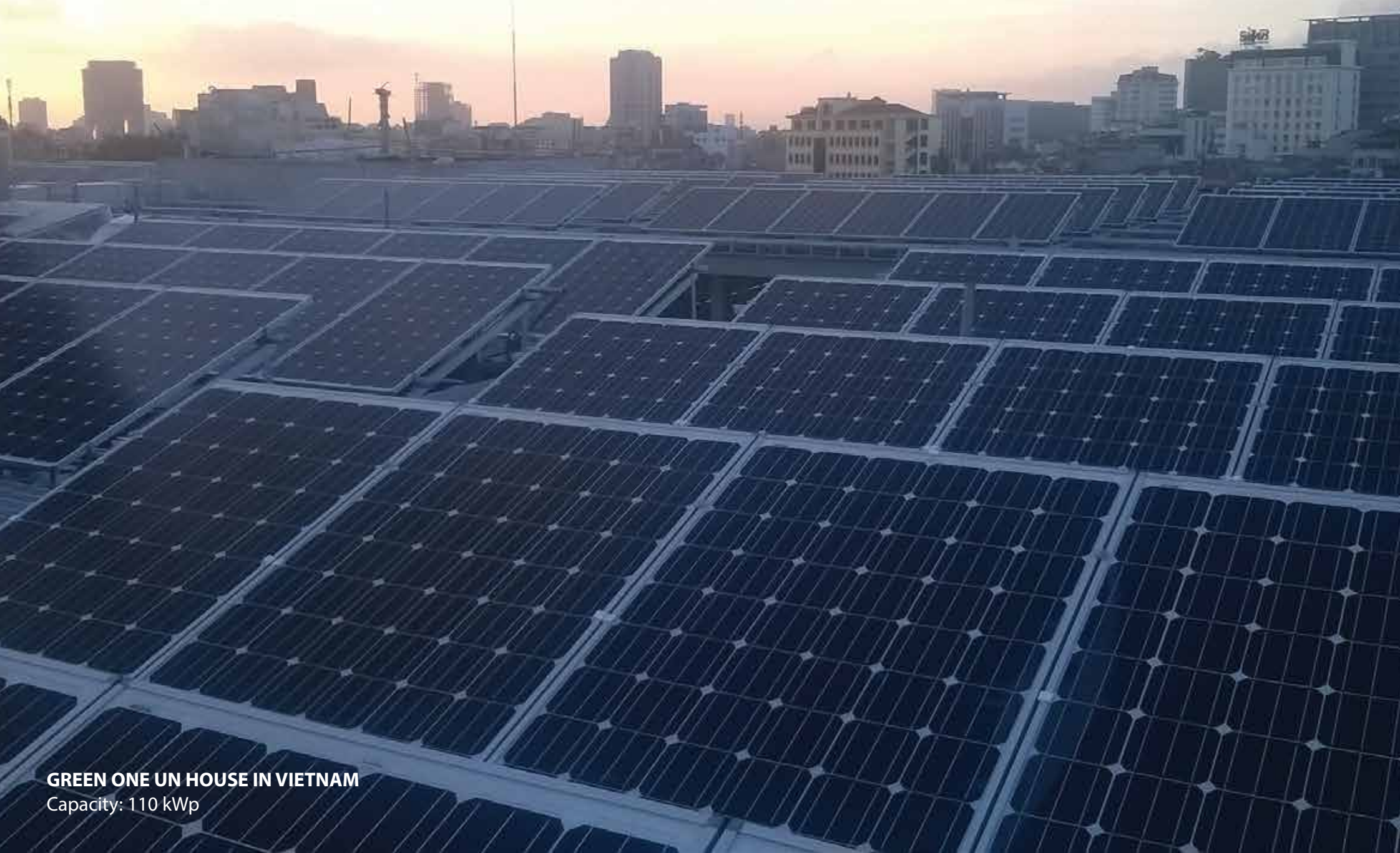
GREEN ONE UN HOUSE IN VIETNAM Capacity: 110 kWp